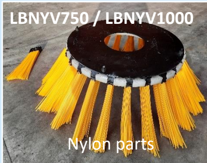
LBNYV750 / LBNYV1000